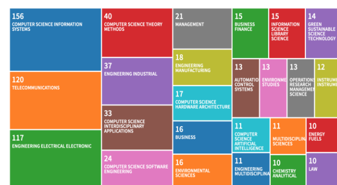
Figure 1: Web of Science Search Results by Discipline.

First, enterprise blockchain and blockchain consortia are a relatively new and quickly growing area of study. Results span an approximately four-year period, with the earliest published in July 2017 and the latest scheduled for publication in August 2021. Seven papers included in the results were published in 2017, while 135 (32% of the total) were published or available for early access during the first half of 2021.